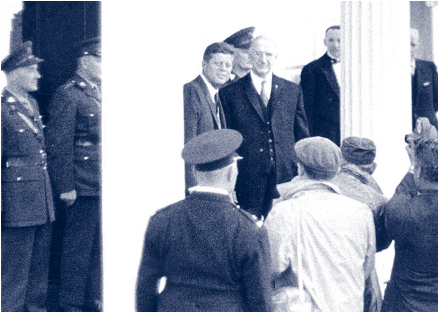
President John F Kennedy and President Eamon de Valera launch The American Irish Foundation 1963