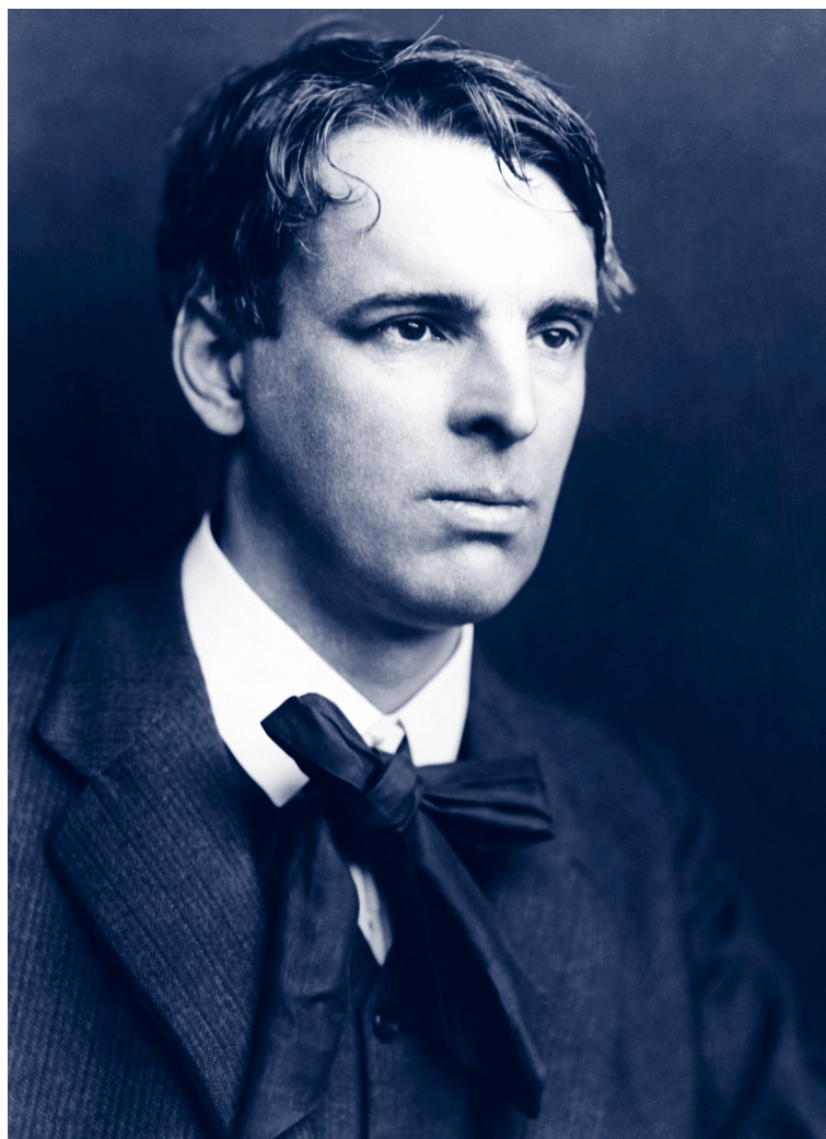
William Butler Yeats