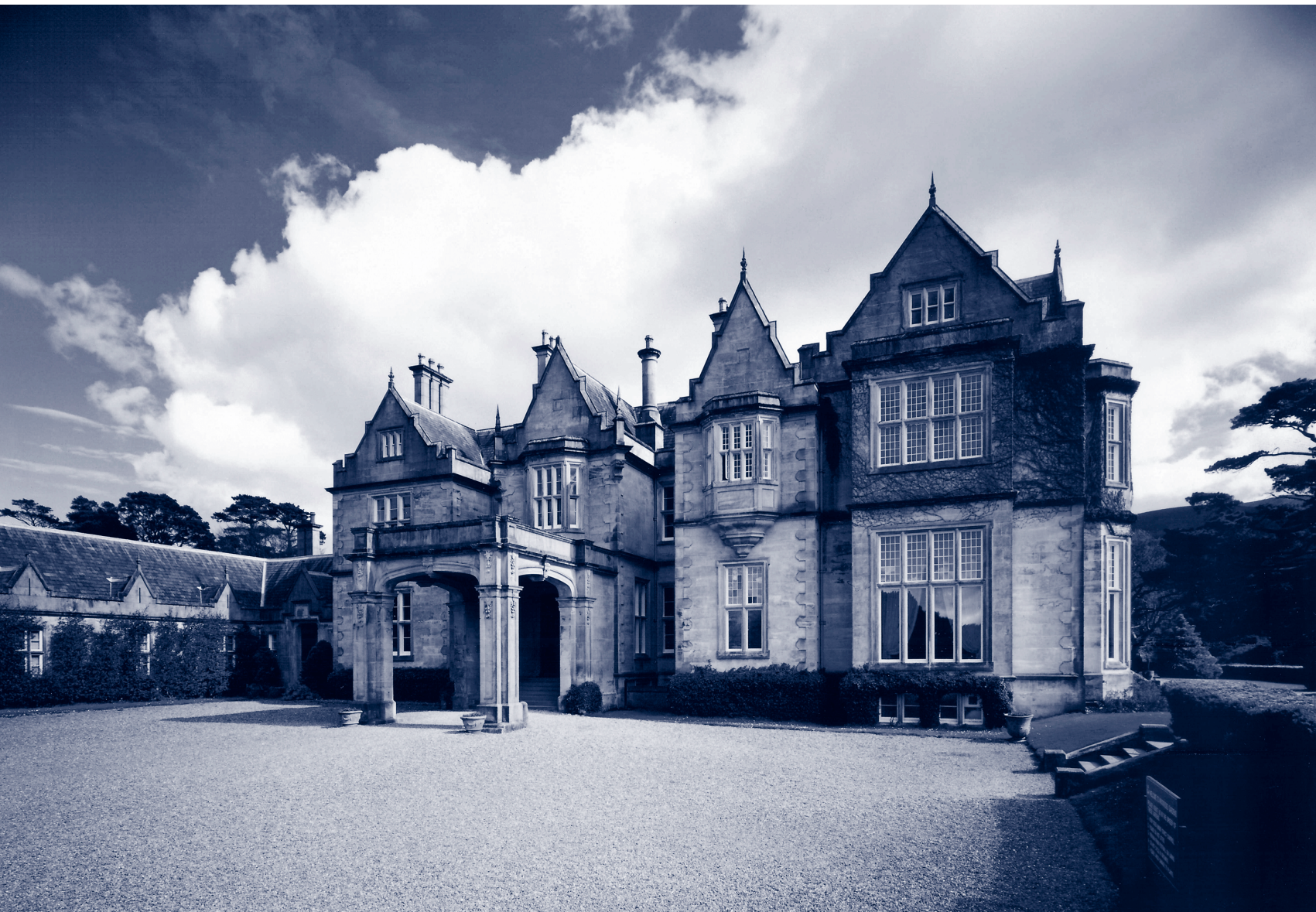
Muckross House, Killarney, Co. Kerry