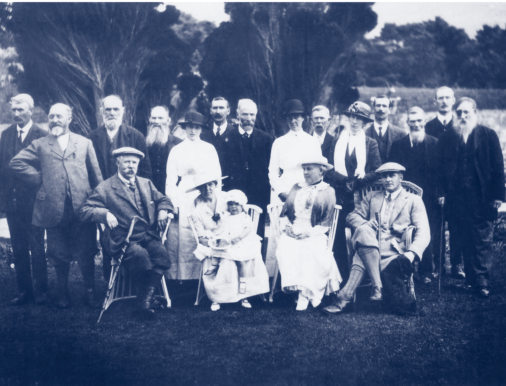
The Bourn-Vincent family at Muckross with many of their principal employees, c. 1916