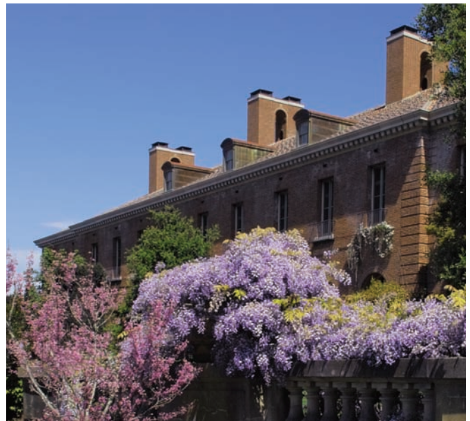
Filoli Gardens, California